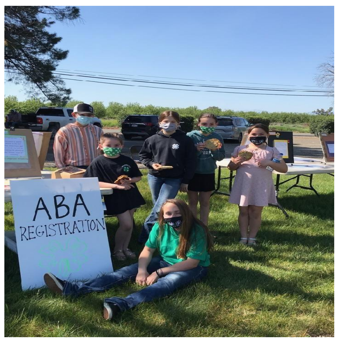
Youth Set Up Committee

A big thank you to all the leaders, youth and parents who helped with the ABA Extravaganza event and set-up, evaluated and tabulated.