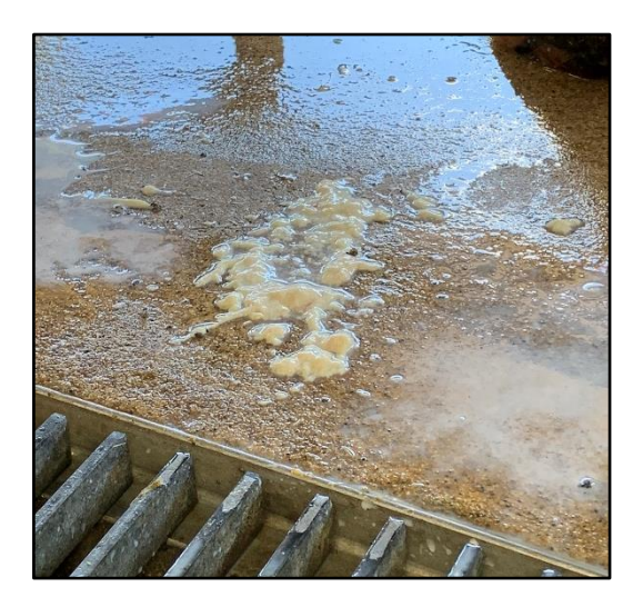
Fig. 1. Mastitis

At milking time, a healthy cow can be mistakenly flagged for mastitis due to teat sealant residue changing the normal milk appearance ( Figure 2 ). Cows treated with internal teat sealant at dry-off can shed treatment residues during the first milkings. While colored sealants are easier to distinguish from milk, white sealants can be mistaken for mastitic milk.