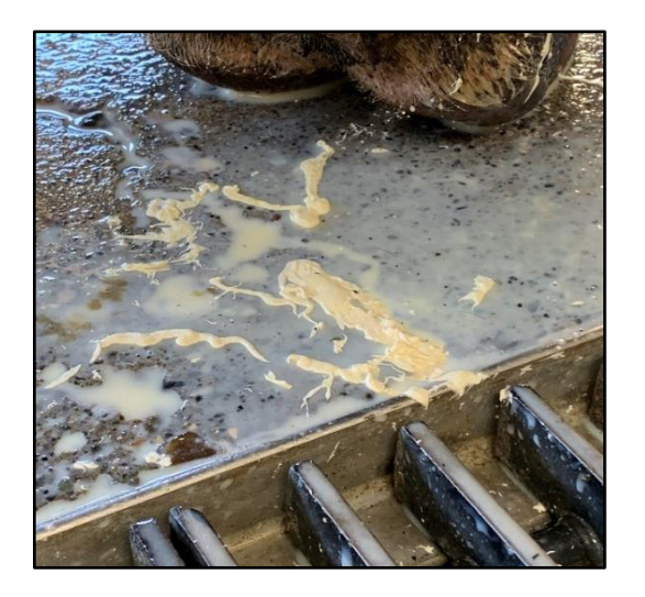
Fig. 2. Internal teat sealant residue

To differentiate cows shedding white internal teat sealant from mastitic cows while stripping, here are some tips: