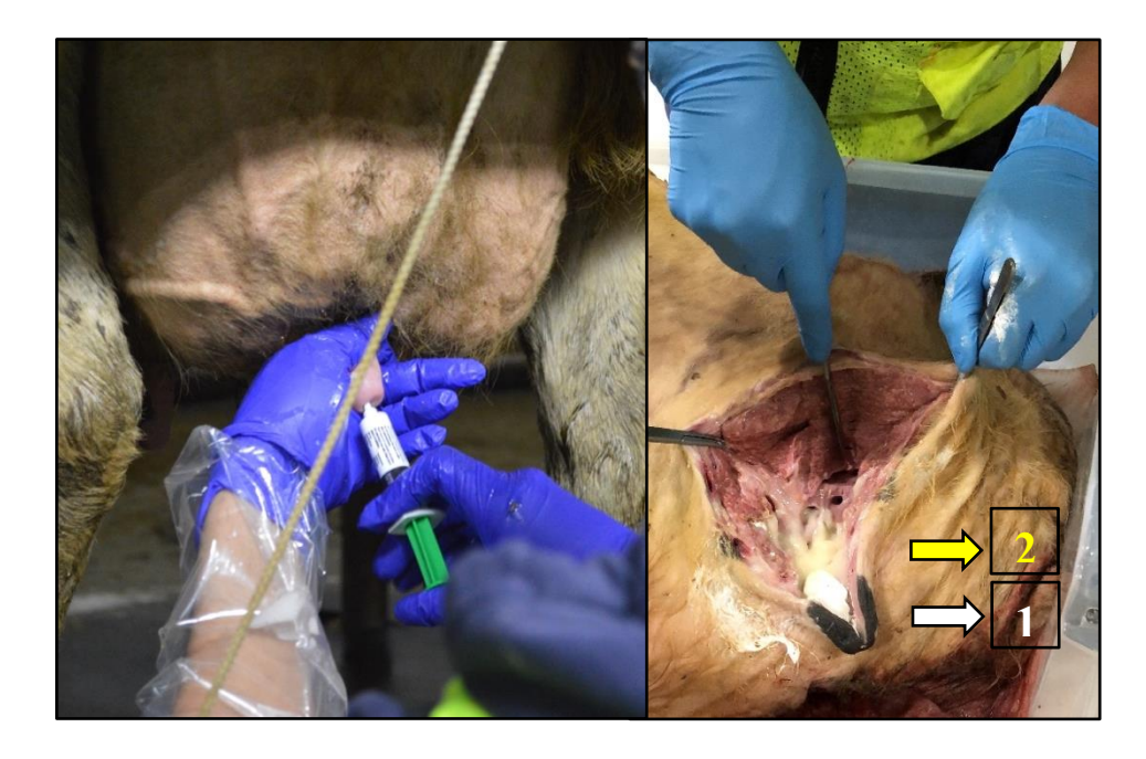
Figure 3. Internal teat sealant application and the correct localization of the sealant in the teat cistern (1) together with the dry cow antibiotic in the gland cistern (2).