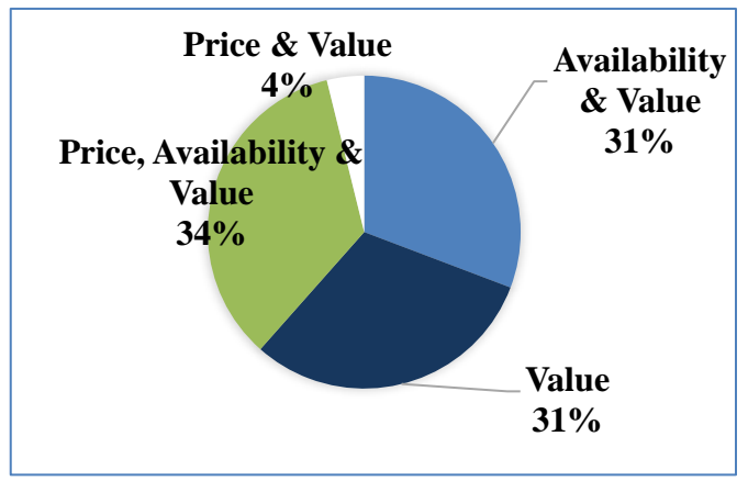
Figure 1. Reasons for incorporating byproducts into dairy rations.