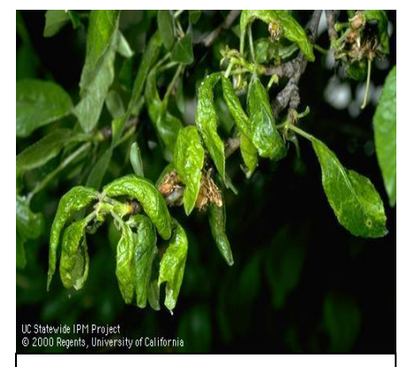
Curling and stunting of leaves caused by mealy plum aphid infestations.

If aphids are a consistent problem in an orchard, a late fall/early dormancy (Nov-early Dec) spray with a low label rate of a pyrethroid insecticide provides good control of aphids. Low label rates of these insecticides applied at this time are effective, yet the risk of surface water runoff is reduced. Oil spray during this period can seriously impact parasites (natural enemies) and is not recommended, especially if leaves are still on trees.