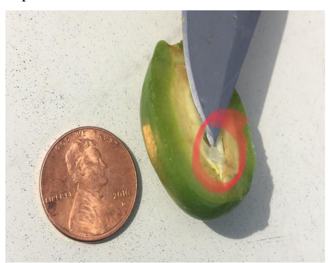
Figure 1. Extraction of the endosperm on a developing prune. When 90% of the fruit cut as in this photo shows endosperm, then the fruit can be shaker thinned if there are too many fruits on the trees.

To find out if thinning is needed, check crop load from 2-3 trees per orchard at or just before reference date, which usually falls between April 20<sup>th</sup> and May 10<sup>th</sup>. Reference date occurs when 80 to 90% of the fruit have a visible endosperm (see Figure 1), which is approximately one week after the pit tip begins to harden. The endosperm, a clear gel-like glob, the beginning of the developing seed, will be found in the seed cavity on the blossom end of the prune (Figure 1) and is solid enough to be removed with a knife point. The warmer the spring, the earlier reference data arrives. Checking crop load this year (2022) will be more challenging given the freeze of April 12.