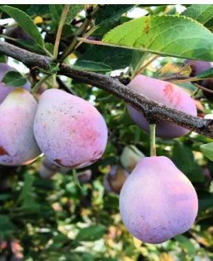
Nitrogen Part 9: Prune