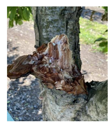
Phellinus Wood Rot in Prunes

Weekly episodes from Growing the Valley podcast keep you up to date with the latest UC best practices in prune, walnut, almond, and pistachio production! Listen at: <a href="mailto:growingthevalleypodcast.com">growingthevalleypodcast.com</a> or wherever you listen to podcasts.