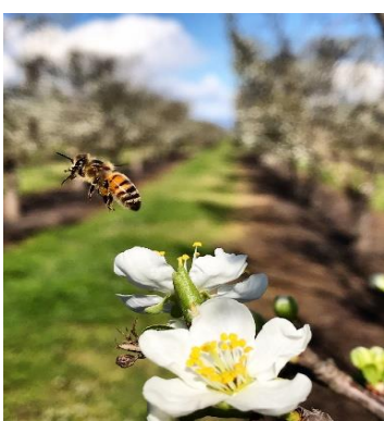
Prune Bloom Weather Conditions