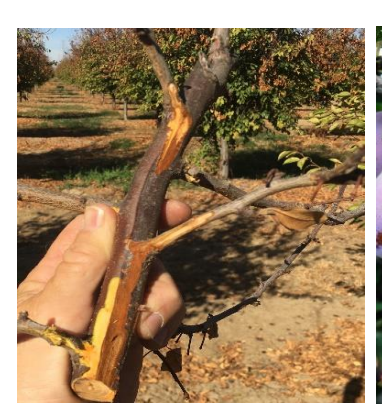
Cytospora in Prune