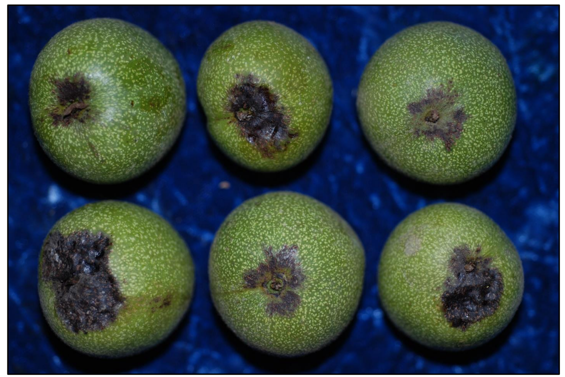
Photo 2. Brown Apical Necrosis (BAN) mold infections in Ivanhoe.

As the fungal infection expands under the hull, the hull is decayed and the infection spreads to the kernel, most likely through the apical end. It stands to reason that improved walnut blight management, particularly of secondary infections, will lead to less BAN although this has not yet been studied. More on walnut blight best management practices at: <a href="mailto:sacvalleyorchards.com/walnuts/diseases/walnut-blight-management/">sacvalleyorchards.com/walnuts/diseases/walnut-blight-management/</a>