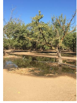
The Dangers of Irrigation Leaks