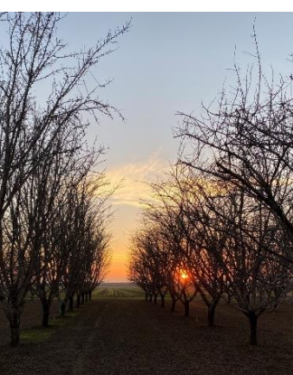
Field Evaluation of Almond Varieties