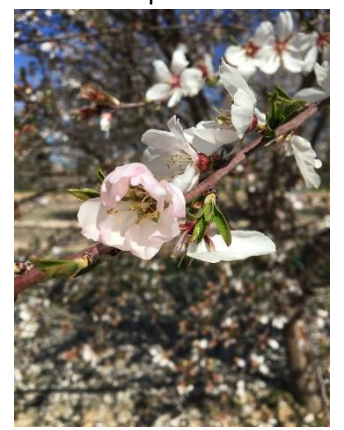
Craig Ledbetter on the USDA breeding program

Weekly episodes from Growing the Valley podcast keep you up to date with the latest UC best practices in almond, walnut, prune, and pistachio production! Listen at: <u>growingthevalleypodcast.com</u> or wherever you listen to podcasts.