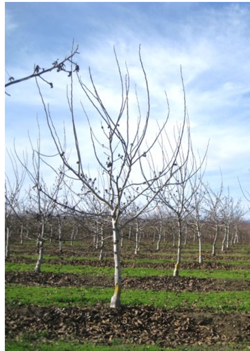
Photo 2. A minimum pruned tree at the end of the third growing season. Note secondary scaffold extension growth from heading cuts.