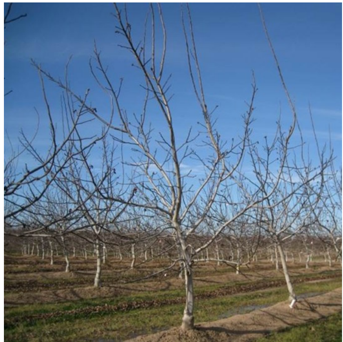
Photos 3-4. An unpruned tree (left) and a minimum pruned tree (right) at the end of the fourth growing season. Note extension growth on unpruned tree in photo 3.