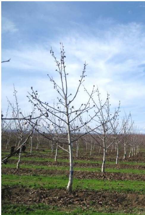
Photo 1. An unpruned tree at the end of the third growing season. Note short shoot growth on primary branches.