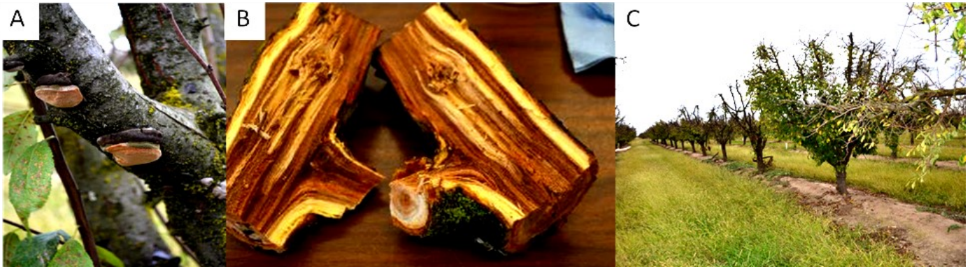
Figure 3. Scaffold: The heart rot of Phellinus tuberculosus , which infects through pruning wounds, is major disease in prune production (A-C). Although Phellinus spp. can infect almond, it is not widely observed, perhaps because there is less pruning performed than in prune production. Much like Ganoderma spp. infections, conks are the only sign visible on the exterior (A). In prune production, heart rot infections often break scaffolds during the shaking process at harvest.