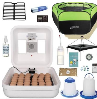
Figure 2: Incubator kit donated by Barceloux- Tibessart Foundation.

additional curriculum. We have received over $29,000 from this wonderful foundation throughout the years and cannot thank them enough. Glenn County 4-H expresses our sincerest appreciation for the opportunity to better our organization for the youth today.