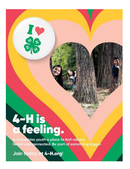
Figure 2: National 4-H Week – 4-H is a Feeling.