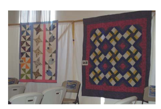
A pair of beautiful quilts.