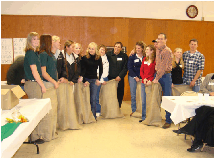
Everyone's ready to run in the three-legged sack race.