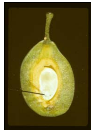
Figure 1. Extracting endosperm at reference date.

Removing some of the fruit early in the season will allow the remaining fruit to grow larger and develop a higher sugar content and improved drying ratio. Mechanical thinning with the same machinery used for harvest is the most practical way of accomplishing this. A representative sample taken at reference date, when the endosperm is visible at the flower end of the fruit (Fig. 1), usually in early May, will allow for an estimation of fruit size at harvest (Table 1). Unfortunately, this procedure will often over-estimate size, especially with a heavy crop load. To get a better idea, using your experience and past production history, estimate the tonnage you can produce at the desired size and determine how many fruit per tree at harvest will result in this yield. For example, 4 tons (8000 lbs) X 70 dry fruit per pound divided by 151 trees per acre (in a 18' x 16' planting) = 3708 fruit/tree at harvest. Adjust this by the estimated pre harvest drop to determine how many fruit should be left after thinning. Work done in the Sutter-Yuba area in the 70's suggested that approximately 40% of the fruit would drop between reference date and harvest. More recent work in Glenn and Tehama Counties has suggested that fruit drop may be closer to 20%. Using 20% drop in our example, 3708 divided by .8 = 4635 fruit left per tree after shaking.