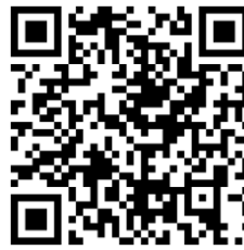
Photo instructions of how to determine dry matter with a microwave oven

Mitigating drought stress in corn information