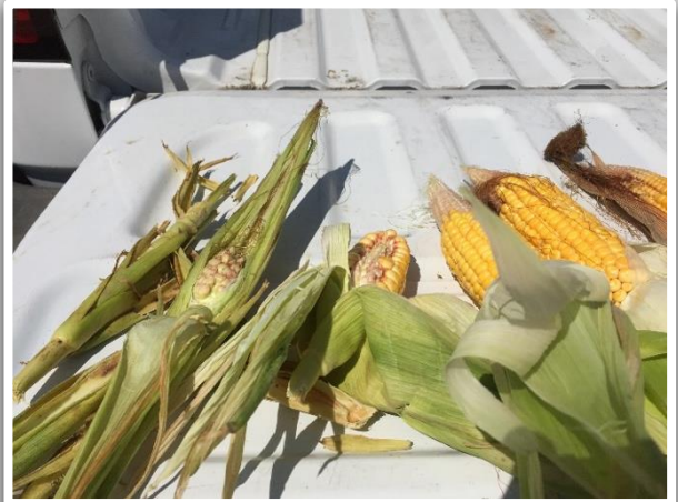
Figure 2. Acute drought stress during corn pollination can cause poor grain set and ear formation (left).