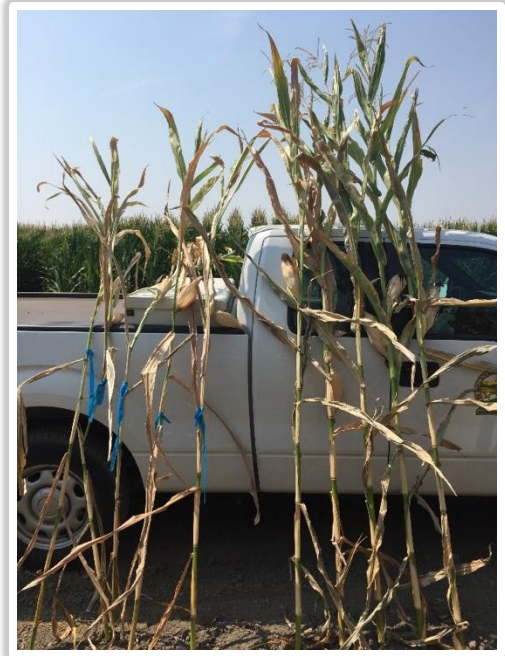
Figure 1. Chronically drought-stressed corn (left) is shorter with thinner stalks and poorly developed ears and tassels.