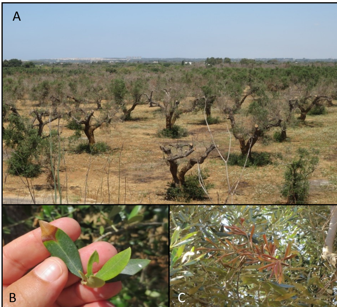
Figure 1. Symptoms of olive quick decline syndrome in Italy include canopy dieback (A), leaf scorch (B), and branch dieback (C).

Olive quick decline syndrome (OQDS) is a destructive new disease currently affecting approximately 20,000 acres of olive in southern Italy—an area approximately the size of table olive production in California. Symptoms of OQDS include extensive branch and twig dieback, yellow and brown lesions on leaf tips and margins, vascular discoloration, and subsequent tree mortality (Figure 1). Similar symptoms have been observed in olives in California, but disease incidence appears to be low when compared to Italy. The causal agent(s) of the disease is still unknown. A number of organisms, including fungi and a bacterium, have been isolated from sick trees in Italy and California. The bacterium Xylella fastidiosa has been found to infect olive trees in both locations. To date, only strains belonging to X. fastidiosa subspecies multiplex have been isolated from olives in California. These California strains have limited association with the disease and experimental infections did not cause disease in olive varieties commonly cultivated in California. In Italy, recent publications indicate that strains of the bacterium isolated from the outbreak area are closely related to X. fastidiosa subspecies pauca , a subspecies group not known to occur in the United States. The OQDS outbreak in Italy marks the first report of the bacterium in the European Union. Research is underway in Italy to evaluate the role of the bacterium in OQDS.