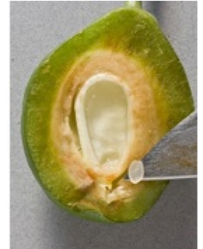
Figure 1. Extracting endosperm at reference date.

By dividing the estimated fruit number at harvest by the estimated or desired dry count per pound and then multiplying by the number of trees per acre, you can estimate the dry pounds per acre. This number will allow you to judge if your estimated fruit size at harvest (from Table 1) is realistic, based on comparisons with crop history - size and yield - from that orchard. You can then determine how many fruit of the desired dry size are necessary to give the expected dry yield and adjust the number upward by 20% to allow for drop. Now compare the two sets of numbers. If the number of fruit per tree measured in your orchard matches the number of fruit per tree at harvest