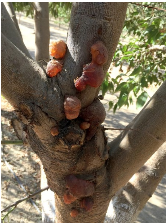
Figure 2. An almond orchard with rampant canker disease resulting from winter pruning and subsequent rainfall.

Bark protects the interior of the tree from disease infection. Pruning exposes sensitive tissue. Pruning cuts require time to heal (reform a protective layer) and during this process pathogens can infect the wood and establish a canker. As the pruning wound ages, both the risk of infection and the canker size of any infection will be reduced. The susceptibility window between pruning and subsequent rainfall ranges widely depending on the pathogen and disease crop combination. UC researchers have susceptibility windows as short as two weeks (e.g. Cytospora canker in prune trees), and as great as twelve weeks or longer (various sweet cherry canker diseases).