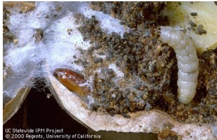
Navel orangeworm larvae, webbing, and frass in a walnut.

In short, don't take your eye off NOW in walnuts, no matter what variety you grow. Much research is still needed to determine the relative importance of a number of factors that may contribute to NOW damage (e.g., native versus immigrant populations; proximity to external sources; previous season's damage; orchard sanitation; overwintering populations; in-season codling moth, blight, and sunburn damage; degree day accumulation; populations cycles in surrounding crops; harvest timing; ethephon application; pesticide choice and application timing; and various environmental conditions). In order to answer the outstanding questions, large data sets will provide the most value. If you would like to discuss the possibility of contributing data to further the cause, please contact me at ejsymmes@ucanr.edu . All private data and site-specific identifiers will be kept anonymous.