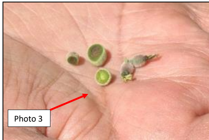
Frost damaged walnut flowers and nutlets. The green nutlet in center (see red arrow) is undamaged.