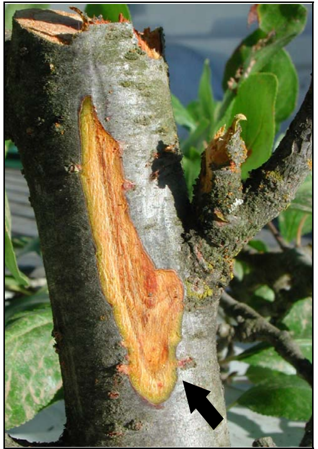
Figure 1. Cytospora cankers are dark and depressed areas on the branch where the bark has been killed. In the first photo, arrow shows edge of canker revealed by knife cut in the second photo.