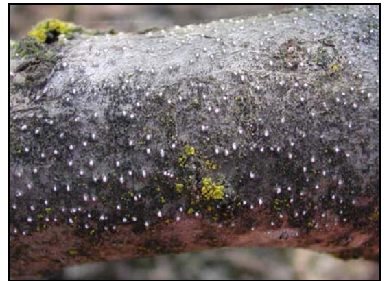
Figure 2. Pycnidia are initially black, but turn white.