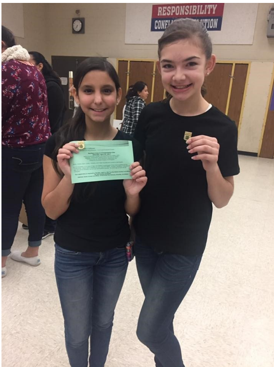
Two Glenn County 4-H members with their County Presentation Day gold medal awards.