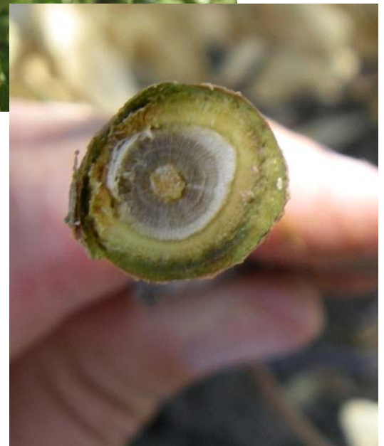
Photo 2 & 3. Xylem darkening in verticillium-affected almond trees