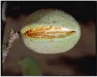
A nut ready for early harvest.

If needed, apply a hull split spray for NOW control once hull split has begun on sound nuts and eggs are being laid on split nuts or egg traps. If sound nuts are splitting, but eggs aren't being laid, wait to spray until you see eggs. If egg laying starts before hull split, wait until hull split starts before spraying. Hull split begins in tree tops on the southwest side. Check nuts in that part of the canopy on 5-6 trees per block