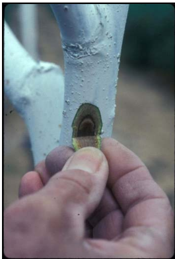
Figure 1. Walnut freeze damaged wood is discolored and dry. Photo, 4/94 by J. Hasey.

If you suspect cold damage, do NOT prune out the damaged limbs. Buds may be slow in opening or buds from deep in the bark may grow to rejuvenate the limb. In the late summer, prune out dead wood that did not revive. New scaffolds that grew can be trained to replace the damaged wood. Reduce or delay spring fertilizer applications where cold damage is evident.