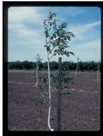
Figure 2. 1-year old Chandler painted white after December 1990 freeze. Damage (no upper shoots) on southwest side of tree.