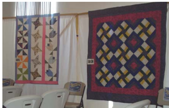
A pair of beautiful quilts.