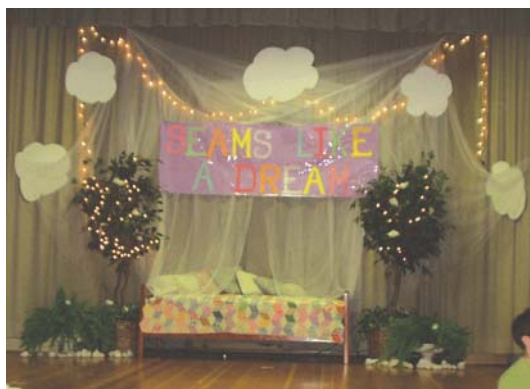
The theme for 2006 was "Seams Like A Dream".