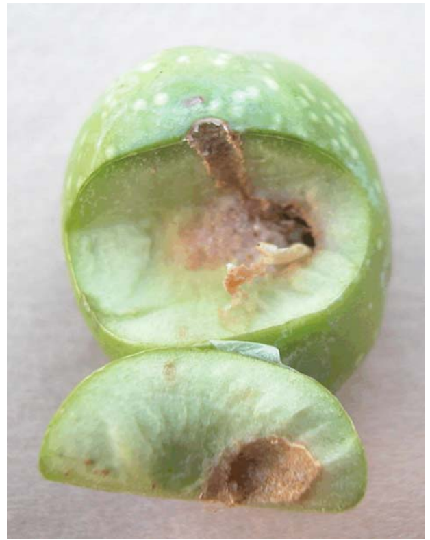
Exposed damage, showing cast pupal skin

Nonprofit Organization U. S. Postage PAID Orland, CA 95963 Permit No. 63