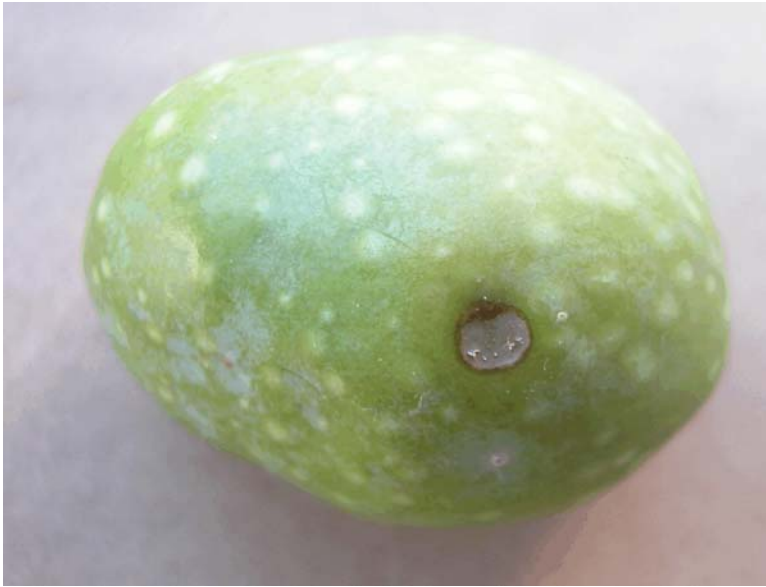
Infested Sevillano olive, outward appearance

See inside newsletter for an olive fly update.