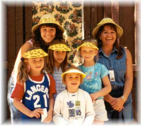
Best Cabin - Girls' Dorm A