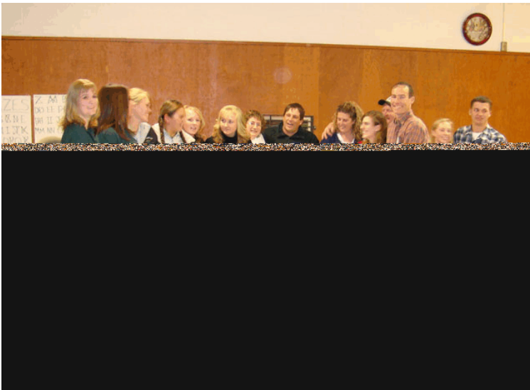
Everyone's ready to run in the three-legged sack race.